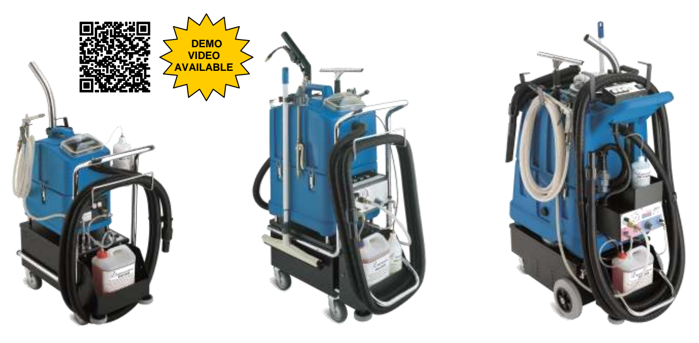
FRV FOOD 15